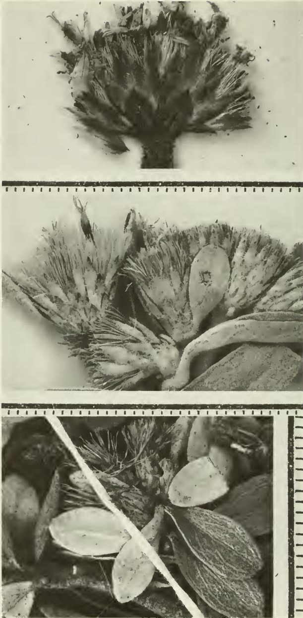
Enlargements of heads. Top. Chresta souzae . Middle. Eremanthus veadeiroensis . Bottom. Lychnophora santosii .